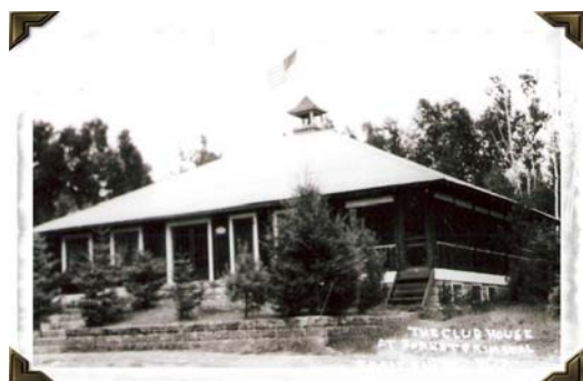
Clubhouse at Forest Primeval c.1930